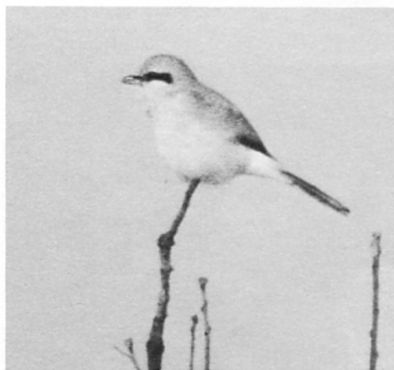
NORTHERN SHRIKE ( Lanius excubitor ) - Haledon Reservoir, New Jersey, December 26, 1983.