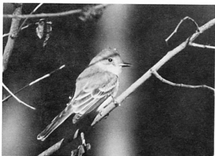
ASH-THROATED FLYCATCHER ( Myiarchus cinerascens ) – Cape May, New Jersey, December 14, 1985.