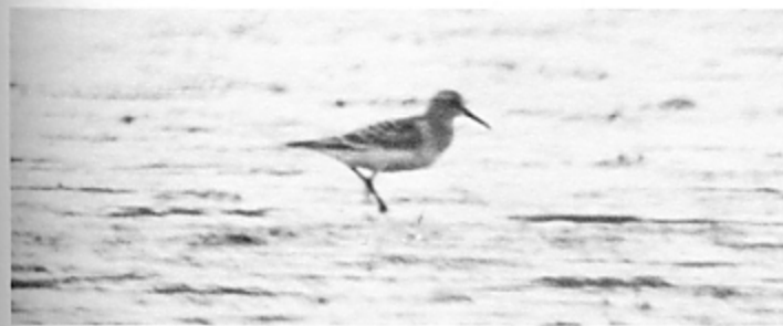
BAIRD'S SANDPIPER ( Calidris bairdii ) - South Cape May, New Jersey, September 10, 1985.