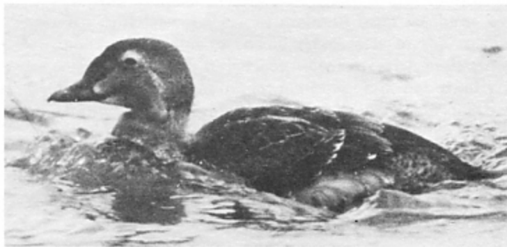
KING EIDER ( Somateria spectabilis ) - North Wildwood, New Jersey, December 22, 1984.