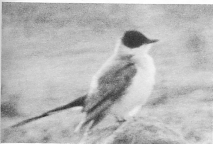
FORK-TAILED FLYCATCHER ( Tyrannus savana ) – Cape May, New Jersey, May 20, 1984.