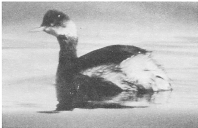
EARED GREBE ( Podiceps nigricollis ) - Caven Cove, Jersey City, New Jersey, March 3, 1985.