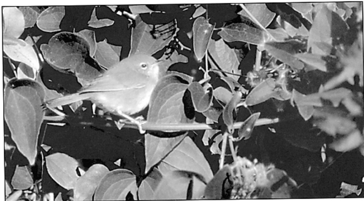
MacGillivray's Warbler, Cape May, N.J., November 1997