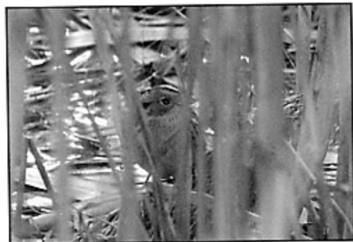
LeConte's Sparrow, Palmyra, N.J., January 1, 1997