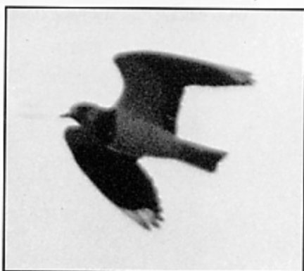
Northern Lapwing, Goshen, N.J., January 1, 1997