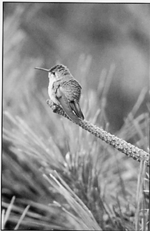
Calliope Hummingbird, Wildwood, N.J., November 1996