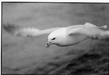
Northern Fulmar, 40 miles east of Manasquan Inlet, N.J., December 7, 1996