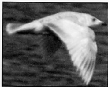
Thayer's Gull, Thompson's Beach, N.J., May 27, 1997