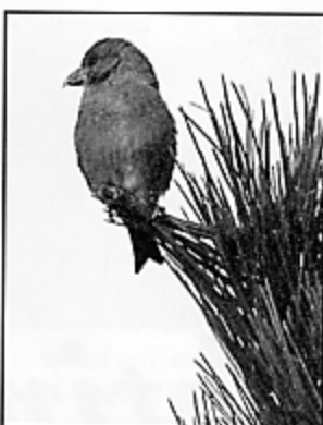
Red Crossbill ( left ), Cape Henlopen, Del., November 1997