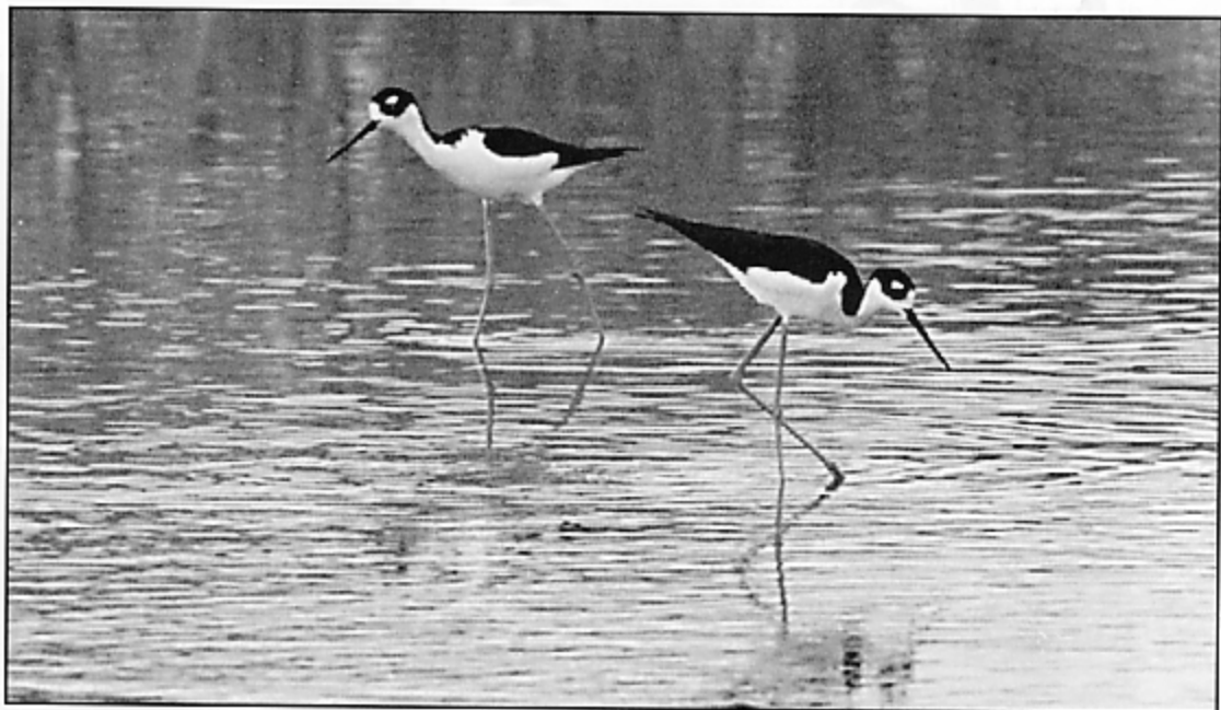
Black-necked Stilts, Cape May, N.J., May 17, 1997