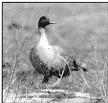
Pink-footed Goose, Oley, Pa. April 2, 1997