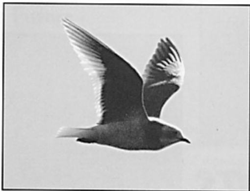
Ross' Gull ( far left ), Indian River Inlet, Del., November 16, 1996