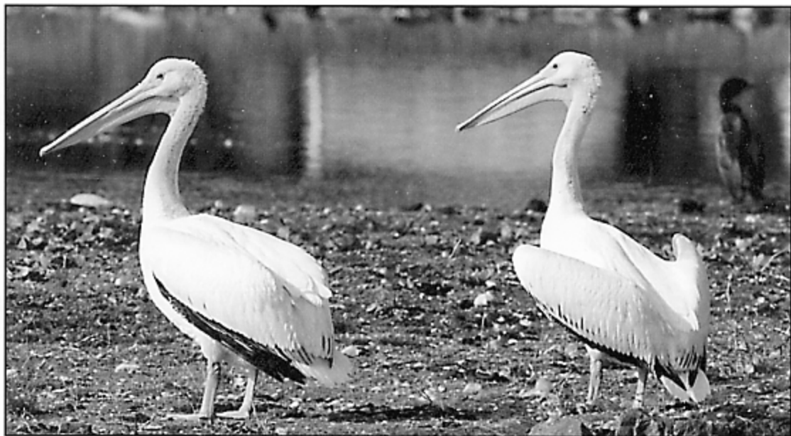
White Pelicans, Cape May Point, October 27, 1996