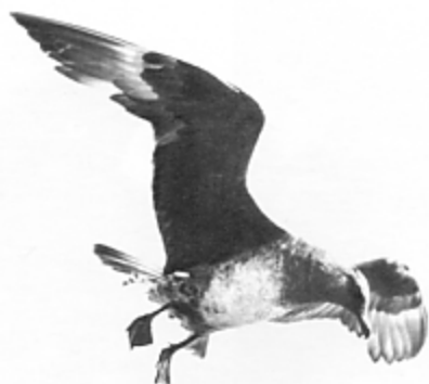
Pomarine Jaeger, 40 miles off Manasquan Inlet, N.J., December 4, 1999