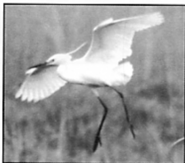
Above: Little Egret, Bombay Hook National Wildlife Refuge, Del., June 20, 1999