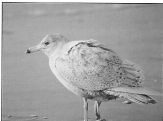
Above: Glaucous Gull, Longport, N.J., March 1, 1998