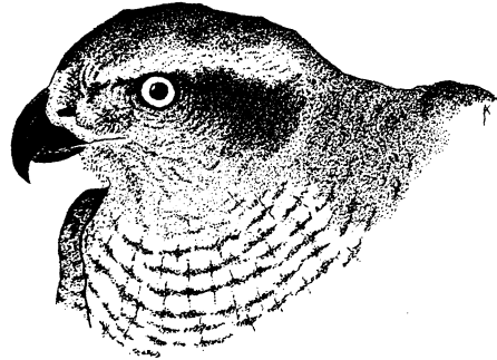
Northern Goshawk