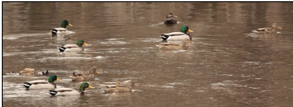
Mallards and American Black Duck along the Tacony Creek.