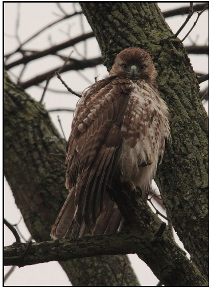
Red-tailed Hawk at Burholm Park.