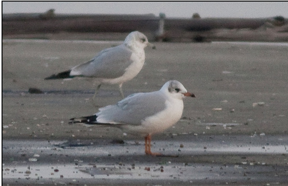
Ring-billed x Black-headed Gull (foreground) along the Delaware River near Reed St.