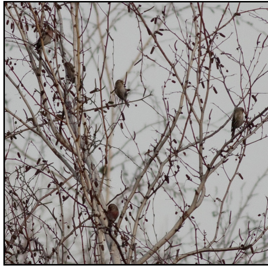
Common Redpolls at the Philadelphia Naval Business Center.