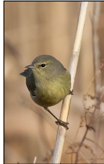
Orange-crowned Warbler at the Philadelphia Naval Business Center.