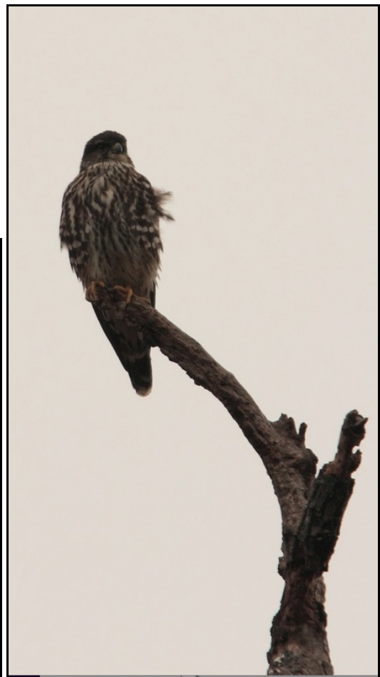
Merlin at Oakland Cemetery.