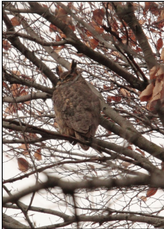
Great Horned Owl at Friends Hospital.