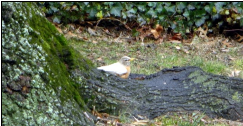
American Robin (partially albino) in East Falls.