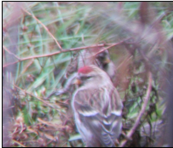
Common Redpolls in Roxborough