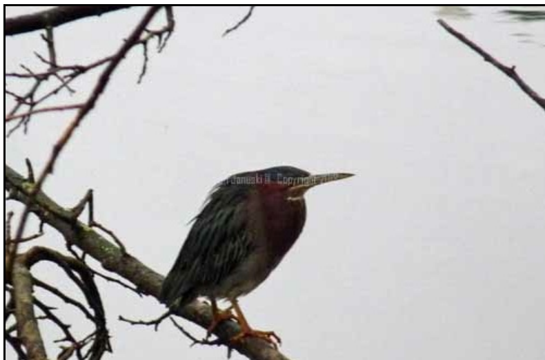
Green Heron along the Manayunk Canal.