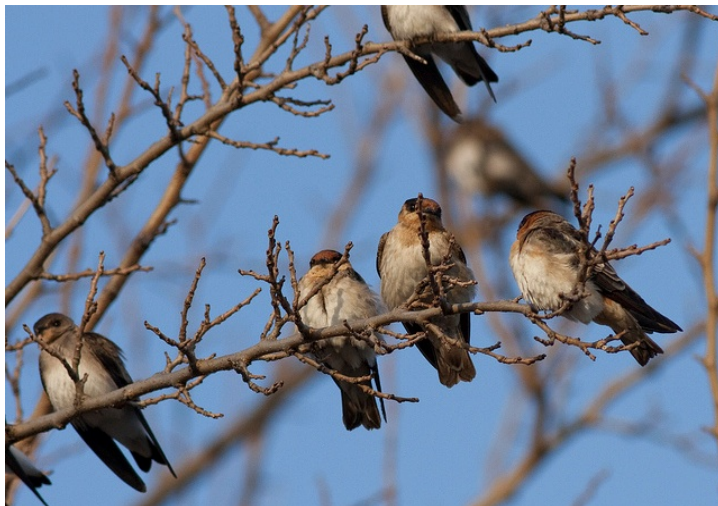
Cave Swallows (3 birds on lower right) at the Northeast Water Pollution Control Plant.