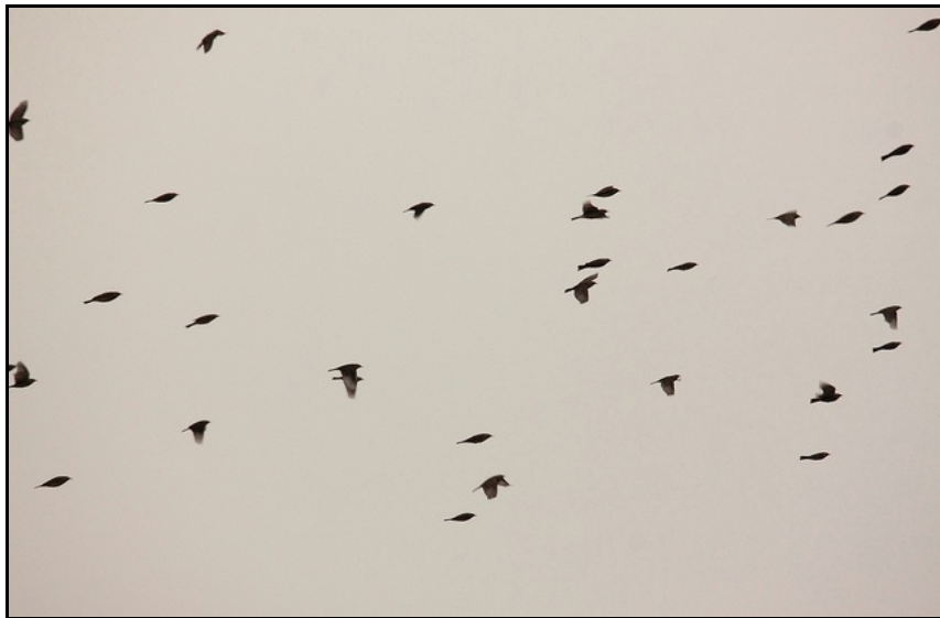
American Pipits at the Northeast Philadelphia Airport.