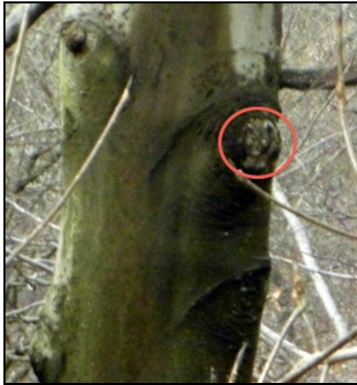
Eastern Screech-Owl in the lower Wissahickon.