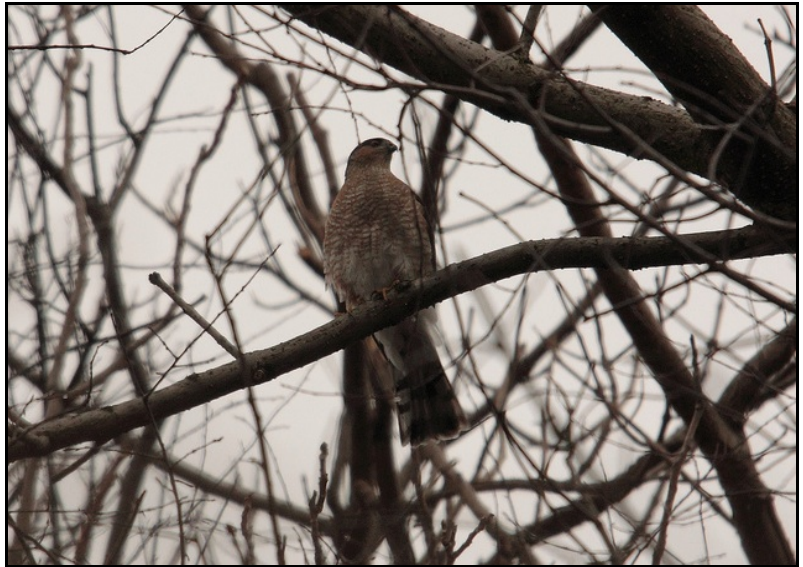
Sharp-shinned Hawk at Friends Hospital.