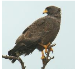
Cuban Black Hawk