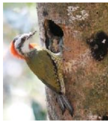
Cuban Green Woodpecker