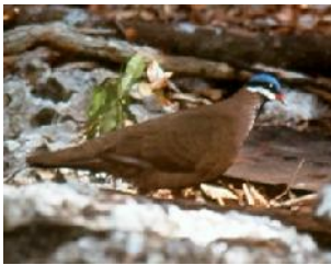
Blue-headed Quail Dove