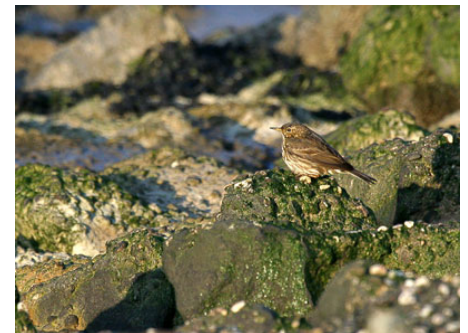
Rock Pipit ~ Photo© N. Murphy

At Neeltje Jans we had eight Razorbills, one of which was relatively close in; a Common (Harbor) Seal; good numbers of Red-breasted Mergansers; Shag (same one as last week, different location); two Lesser Black-backed Gulls, one of which may well have been the nominate race; a large group of Dunlins and Grey Plovers as well as two Bar-tailed Godwits. Best of all, Bert located the loon that we had driven all that way to see. We had side by side comparisons of (Arctic) Black-throated and (Common) Great Northern Loon, showing not only the size difference (Arctic was about 3/4's the size of Common) but also the structural differences (shape of the head and bill) and finally the very obvious white flank patch. It was one of those days that could not have worked out any better.