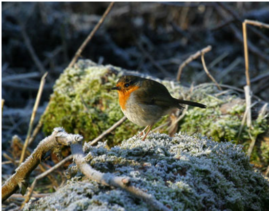
European Robin

bers the likes of which we had never seen before. We reached Zeewolde on Flevoland by the time it was getting dark, and checked the marshes where thousands of Tufted Ducks and Common Pochards, along with several dozen Smew, were settling in for the evening. We tried for Water Rails and had two or three respond to our tape and then called it a day.