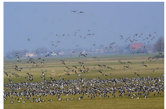
Flocks~ Photo © N. Murphy

We headed north over the Markerwaarddijk that separates the IJsselmeer from the Markermeer to Den Over. It was low tide, and though we could see that there were many birds out there, we decided to move further around the top to Kleiput Vatrop. Here the birds were just as far out, but we did not have to walk too far to scope them. The tide line was a good 600 yards out and the birds stretched from one end to the other. There was an assortment of thousands and thousands of birds, including spectacular flocks of Dunlin. For us at least, the highlight was a Hooded Crow that was being chased by gulls from the tide line to close to the shore before they gave up.