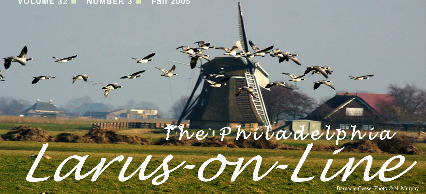
Barnacle Geese

DIGITAL NEWSLETTER OF THE DELAWARE VALLEY ORNITHOLOGICAL CLUB