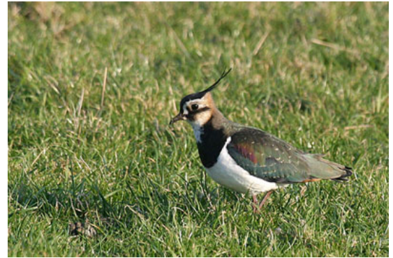
Northern Lapwing

One nice consolation was a Redwing on a front garden lawn just outside Renesse. The Neeltje Jans produced a pair of Sanderlings (we could see about 40 feet in front of us) and while driving, our first Great-spotted Woodpecker flew over the vehicle. Leaving the south, we stopped along the causeway at Philipsdam and it looked as though there would have been a great deal to scope if it had been clear, but alas, all we could make out were the hundreds of (Eurasian) Oystercatchers and Brant along the edge of the water and a lone Red Knot. A