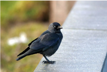
Jackdaw ~