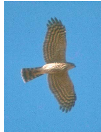
Sharp-shinned Hawk.

So that leaves shape and flight style, the two characteristics that are the most useful in identifying any hawk. The head of the Cooper's is noticeably larger than that of a Sharpie, protruding much further forward than a Sharpie's head. This is partly because the Cooper's head actually is larger, but mostly because the birds hold their wings differently when soaring: Cooper's hold