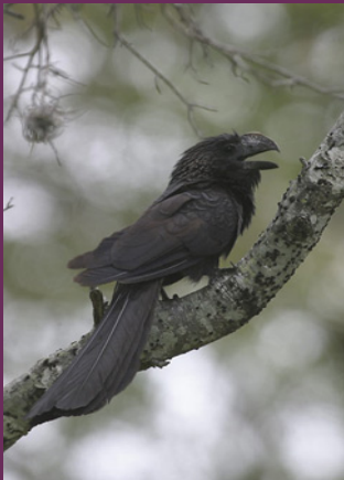
Smooth-billed Ani