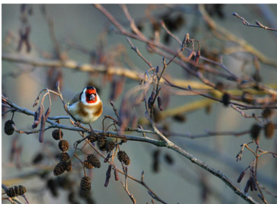
European Goldfinch

day. We left it to the staff to sort out the problem.