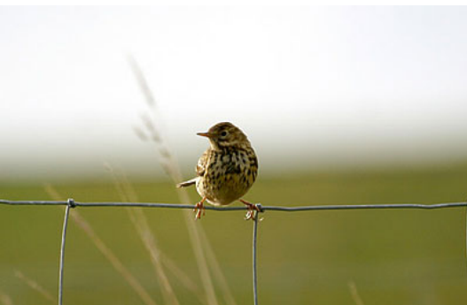
Meadow Pipit ~ Photo© N. Murphy

By the time we had finished breakfast (8:15), dawn had broken and we headed out to the fields east of our hotel in Schouwen to a large wetland known as Plantureluur. The sheer volume of birds was overwhelming. Sporadic reports over the last few weeks indicated that two Red-breasted Geese