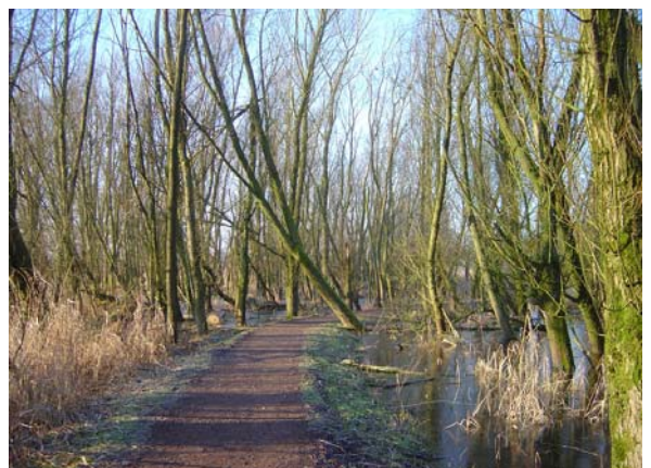
Zeeland Trail ~ CONTINUED ON PAGE 19