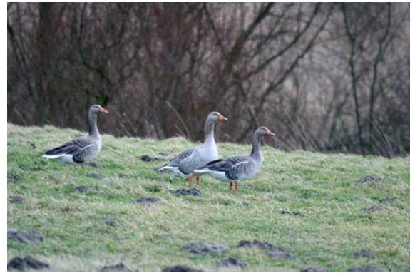
Graylag Geese

After a very quick stop for a sandwich on the go, we worked our way down the southwestern Friesland coast from Harlingen to Oudemirdum. We checked many flocks of geese for Lesser White-fronted and Red-breasted, but the task was daunting to say the least. Barnacles and Greater White-fronts were all over the place in the thousands...tens of thousands. We scanned the closer flocks thoroughly, but we were unable to do justice to the more distant flocks and to the huge constantly moving skeins as they flew in and out. We probably only covered a fraction of what was out there. It was an amazing sight to see and in the end, it got the better of us. We checked the Waddensee for any sea ducks but were disappointed by the lack of activity. We had better luck on the IJsselmeer when we finally located a dozen or so Greater Scaup amongst Great Crested Grebes and (Common) Goldeneye. Back to the polders, we came across an estimated 2000 (Eurasian) Curlews in a field, num-