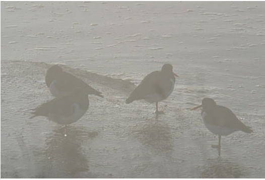
Eurasian Oystercatchers ~ Photo © N. Murphy

female (Eurasian) Sparrowhawk that landed on a gate a short distance from us.