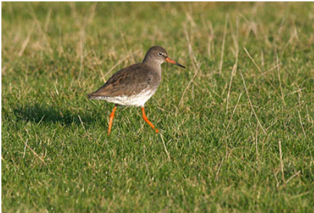
Common Redshank

Our early success with the goose freed up a great deal of time and so, by mid morning, we headed into the woodlands at Veluwe. We found large flocks of Brambling and (European) Siskins feeding on the larch cones at the tops of the trees. At times, the noise was deafening and the birds all around us. Blue and Great Tits were common, but we also found many Willows, one Marsh, one Crested and several Coal Tits to round out our tit list. We heard a Black Woodpecker calling and were able to track down this beast of a bird, a female, which flew to the top of a tree and then around the area for a minute or two before disappearing into the woods. Great Spotted Woodpecker, Short-toed Treecreeper, Goldcrest and (Eurasian) Nuthatch rounded out an excellent hour of birding.