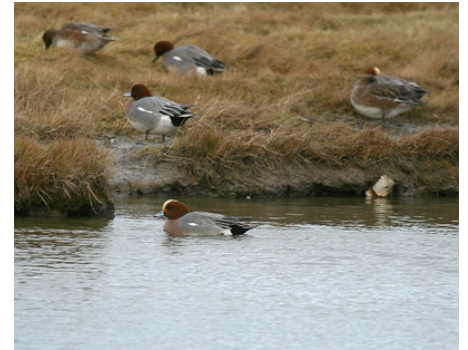
Eurasian Wigeons ~

It took a couple of hours, but we made it back to the Zeeland area. The mist was not as bad as last Friday and we were able to use our scopes. We looked for flamingos at Philipsdam which was a bust though we did get a good laugh when I stopped someone to ask if he spoke English. "Certainly" was the reply. "Have you seen any flamingos?" I asked. "Many, many" he replied. I was onto a winner here, so I asked, "Can you tell me where?" as I pointed to the shallow bodies of water around the sluice gates. "Not here, back in my home country" was his reply. He was German. There's always a comedian about, even in the middle of nowhere. We did get an odd pairing of Canada and Cackling Goose here.