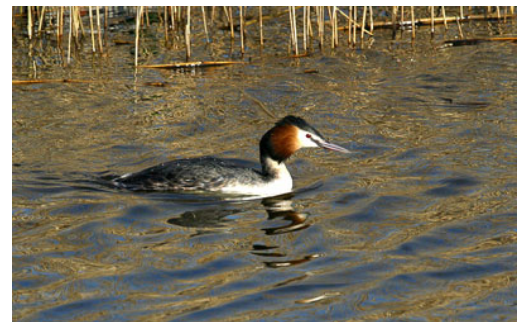
Great-crested Grebe ~ Photo © N. Murphy

The polders (reclaimed land) around Ouddorp were outstanding. First we saw a (Eurasian) Curlew or two, followed by a few Egyptian Geese, and then many more of each species. We had a large flock of Greater White-fronted Geese and an even larger flock of Barnacle Geese. The biggest surprise was the mother lode of plovers, no doubt all European Golden, which swirled about the sky. A conservative estimate would be 10,000 birds. It was a sight to see, even though it was at a great distance. A few Brant of the dark bellied subspecies were scattered amongst the geese, and (Northern)