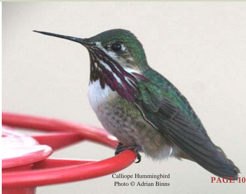
Calliope Hummingbird

Shortest Wingspan: Calliope Hummingbird 4.25"