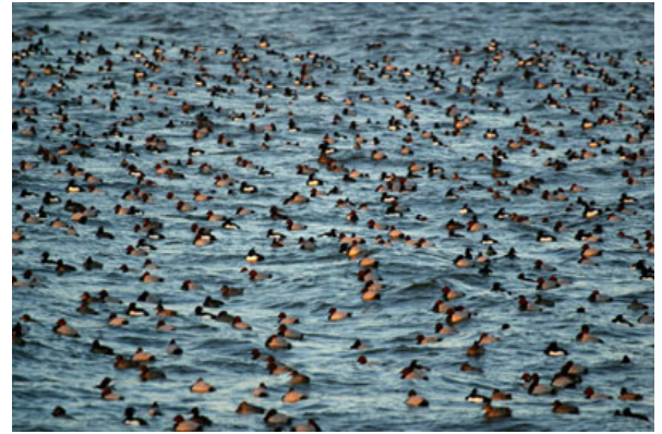
Roosting Ducks