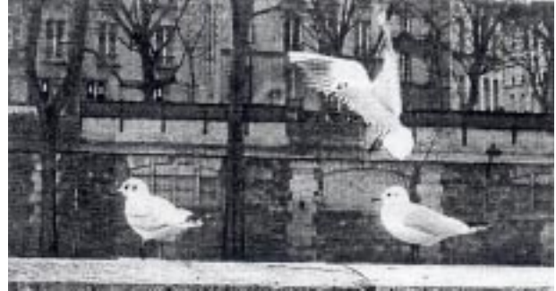
Black-headed Gulls

A little later, from the parking lot of Green Street Condominiums, we had birds close enough to appreciate. Besides Long-tailed Ducks and Scaup, we had White-winged, Surf and Black Scoters. A Peregrine Falcon cruised by.