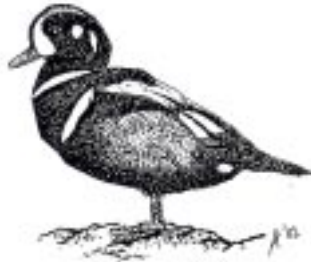
Harlequin Duck