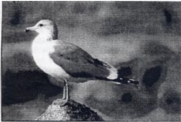
California Gull

The Niagara River runs north from Lake Erie about 35 miles to its mouth on Lake Ontario. It is largely ice free in winter and is a source of food and shelter for gulls. Nine species regularly occur there in winter, and 19 have been recorded over the past several years. The one-day record of 14 species occurred during the peak fall-winter window in November, 1995.